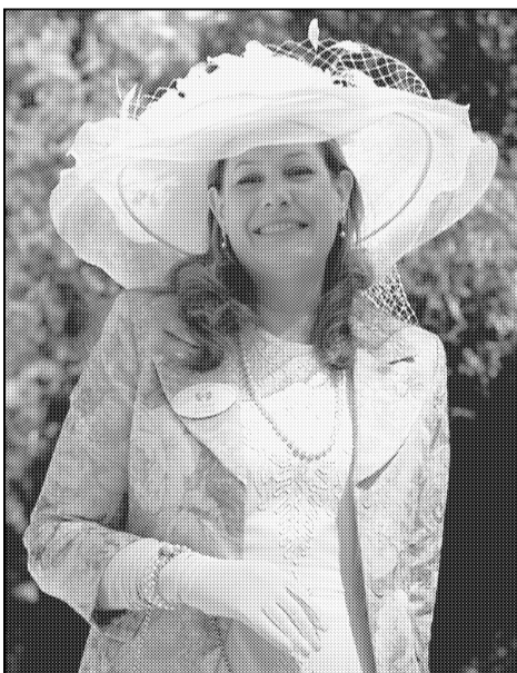
Agencja artystyczna - Partus

On April 18 the lovely garden and woods area of the Arden home of Helena Modjeska, the greatest Polish actress of all time, was the setting for the celebration of her life - near the 100th anniversary of her death.