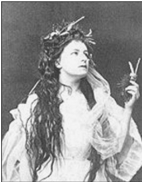
Helena Modjeska (Modrzejewska) as Ophelia in Shakespeare's Hamlet performed in Austrian Poland 1867

On April 18 the lovely garden and woods area of the Arden home of Helena Modjeska, the greatest Polish actress of all time, was the setting for the celebration of her life - near the 100th anniversary of her death.