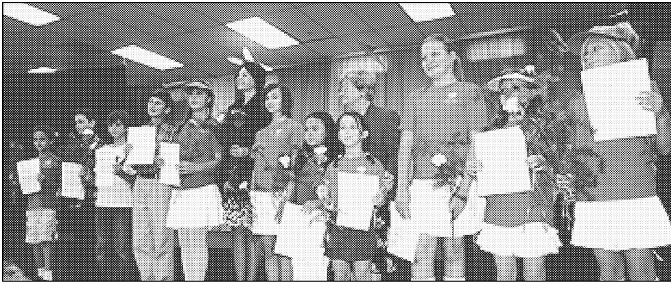
Children received awards for participating in an essay contest, school certificates, and prizes donated by the Polish American Congress

When preparing the paper this page was printed several times (for checks and rechecks, revising and editing) and all pictures printed - NO PROBLEMS!!! While getting ready to go to the printer, we printed all 24 pages and did not check the printout (s) surmising all will be okay. Lesson learned!!!