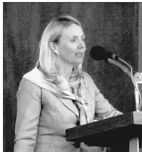
Consul General Joanna Kozińska-Frybes

The existence of a constitution brings equality. Equality in the world is what everyone wishes for, what everyone dreams about. On May 3, 1791, the Polish nation was the first in Europe to reflect its desire to make this dream a reality through the signing of their Constitution - a document of civil liberty, binding the government's responsibilities to its people. Sharing the same devotion to freedom and liberty manifested in the Constitution of the United States of America, Poles to this day continue celebrating this memorable occasion.