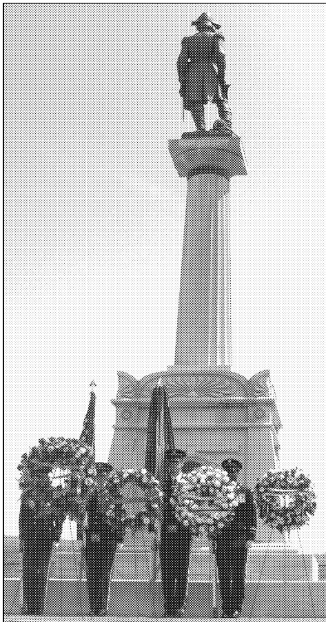
The statue of Kościusko at West Point overlooking the Hudson River

On April 30th and May 1st the American Association of the Friends of Kościusko at West Point (AAFKWP) conducted the seventh scholarly Kościusko Conference, Observance and Commemoration that united Polish Americans, Lithuanian Americans, and all American friends of Thaddeus Kościusko. The weekend of events also included the 600th anniversary year commemoration of the July 15, 1410 Battle of Grunwald/Zalgiris/Tannenberg as well as the 264th anniversary year of the birth of Kościusko.